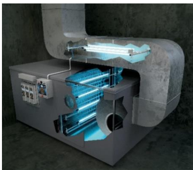
AHU / RTU & Airstream Disinfection