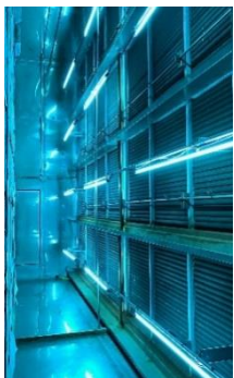
Air Handler Disinfection

For more information on Fresh-Aire UV systems or to discuss your specific application, please contact 1-800-741-1195 or email sales@FreshAirUV.com .