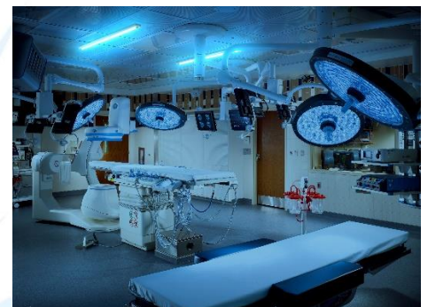
Room / Surface Disinfection (unoccupied)

Fresh-Aire UV systems are installed within the HVAC system and are not intended to diagnose, treat, prevent or cure any disease. The systems have not been tested on coronavirus and is not a medical device.